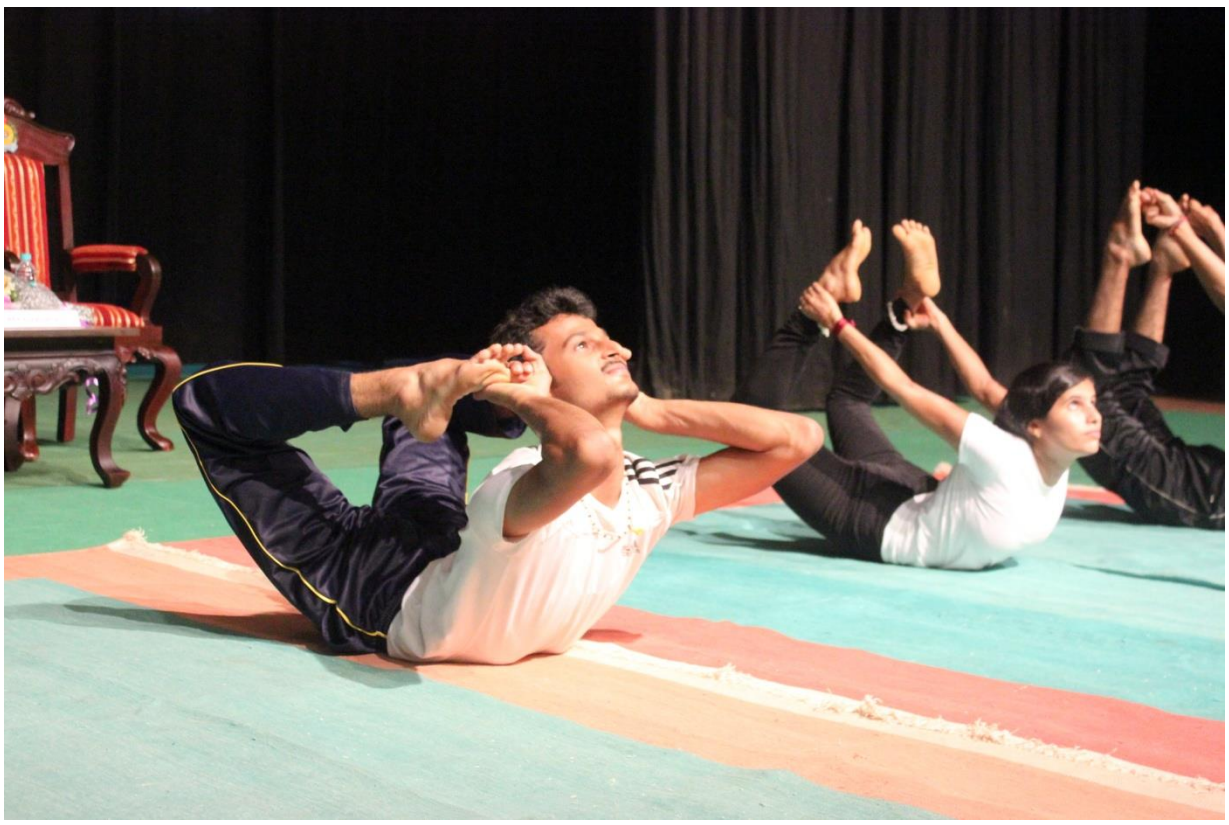
Practical demo –Varieties of Dhanurasana