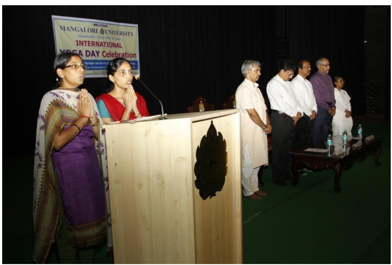
Invocation on the occasion of formal function – International yoga day celebration