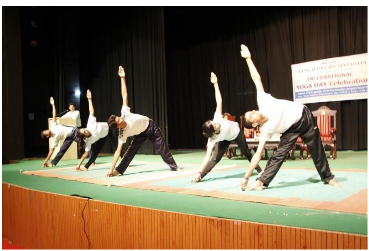
Practical demo - Trikonasana