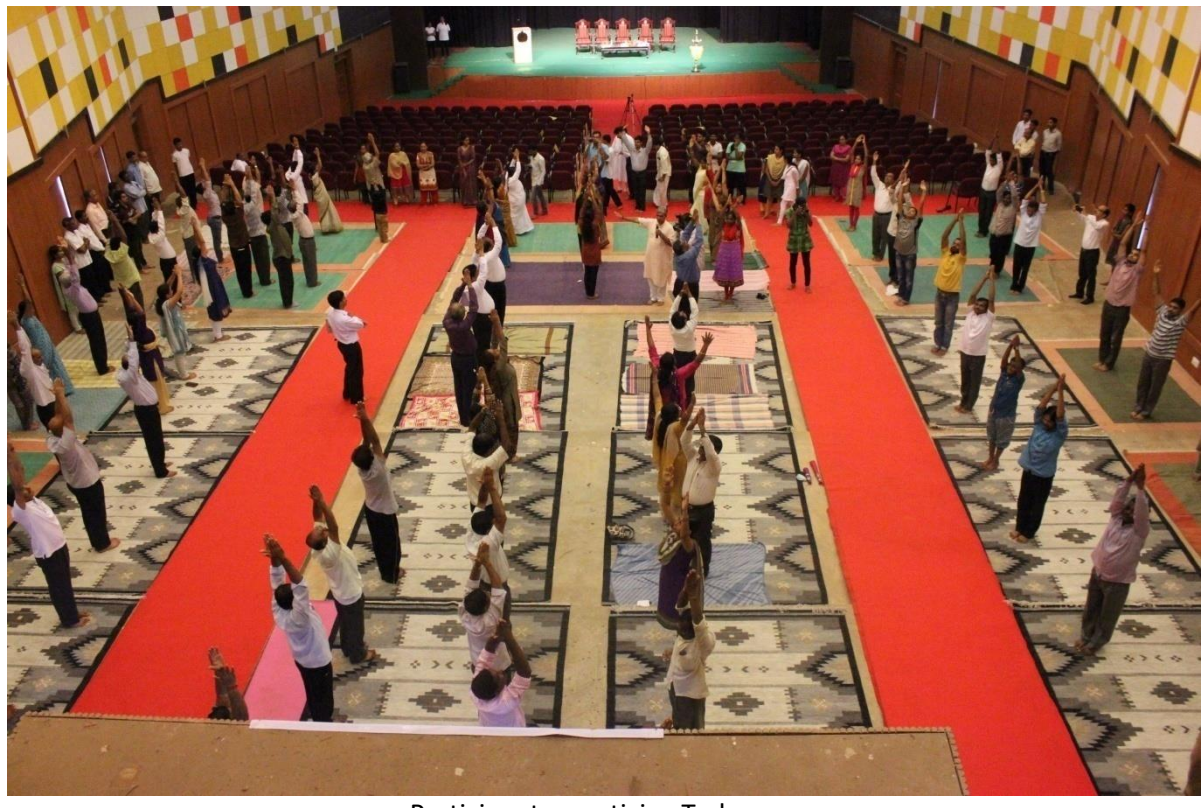
Participants practicing Tadasana