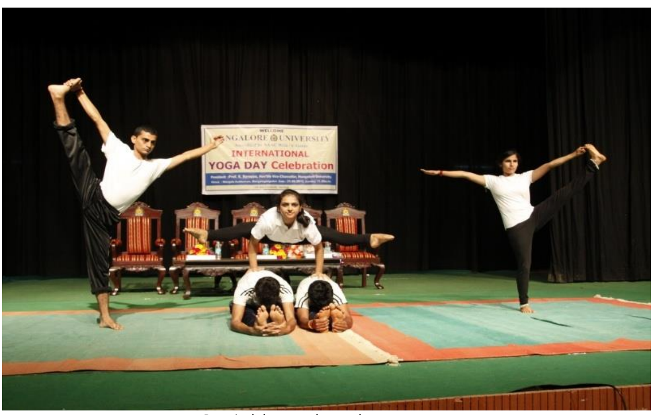
Practical demo –advanced asanas