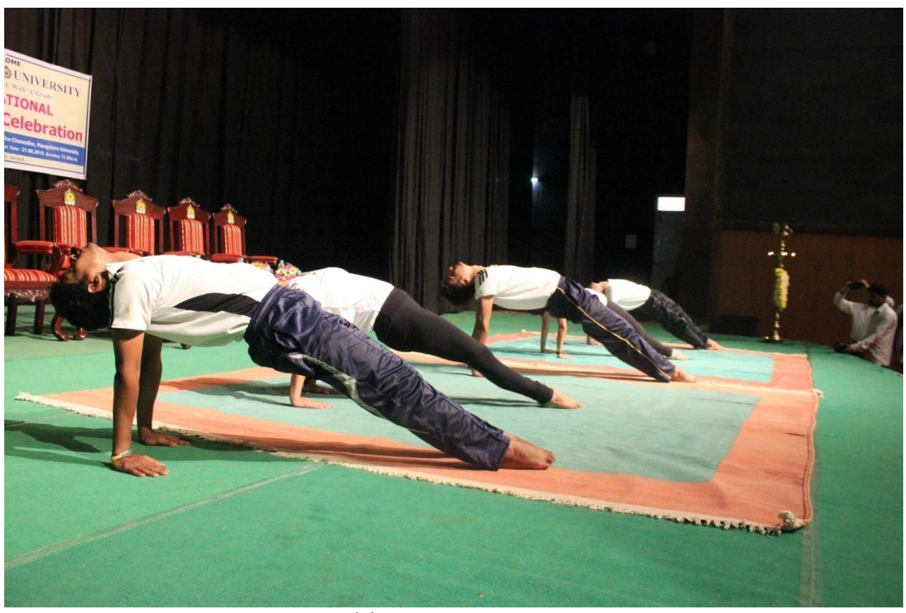
Practical demo –Purvottanasana