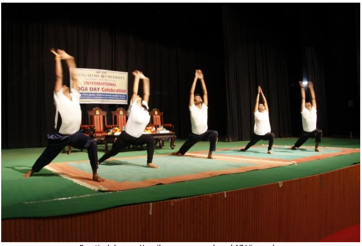
Practical demo – Yaugika surya namaskara ( 17 Vinyasa)