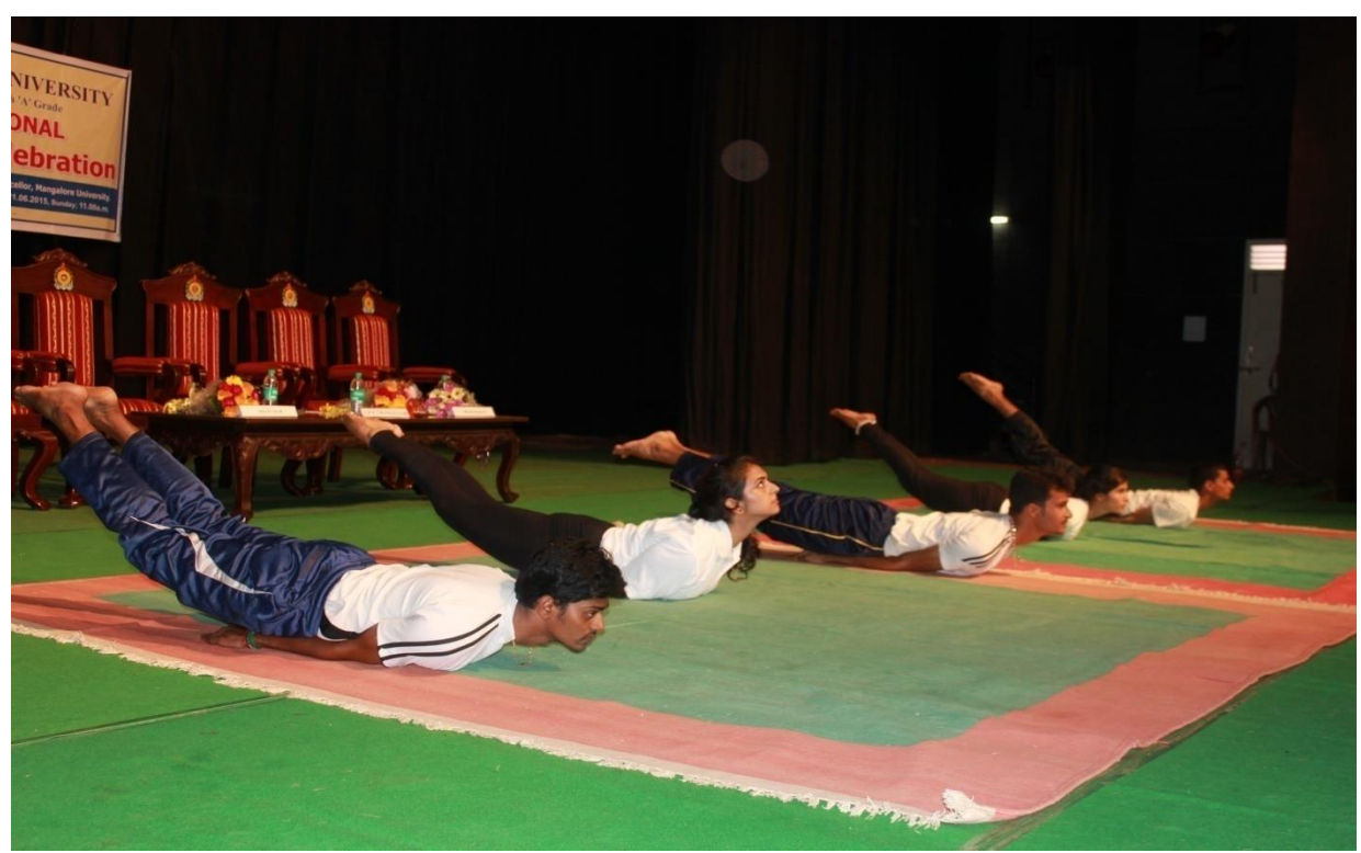
Practical demo –Shalabhasana