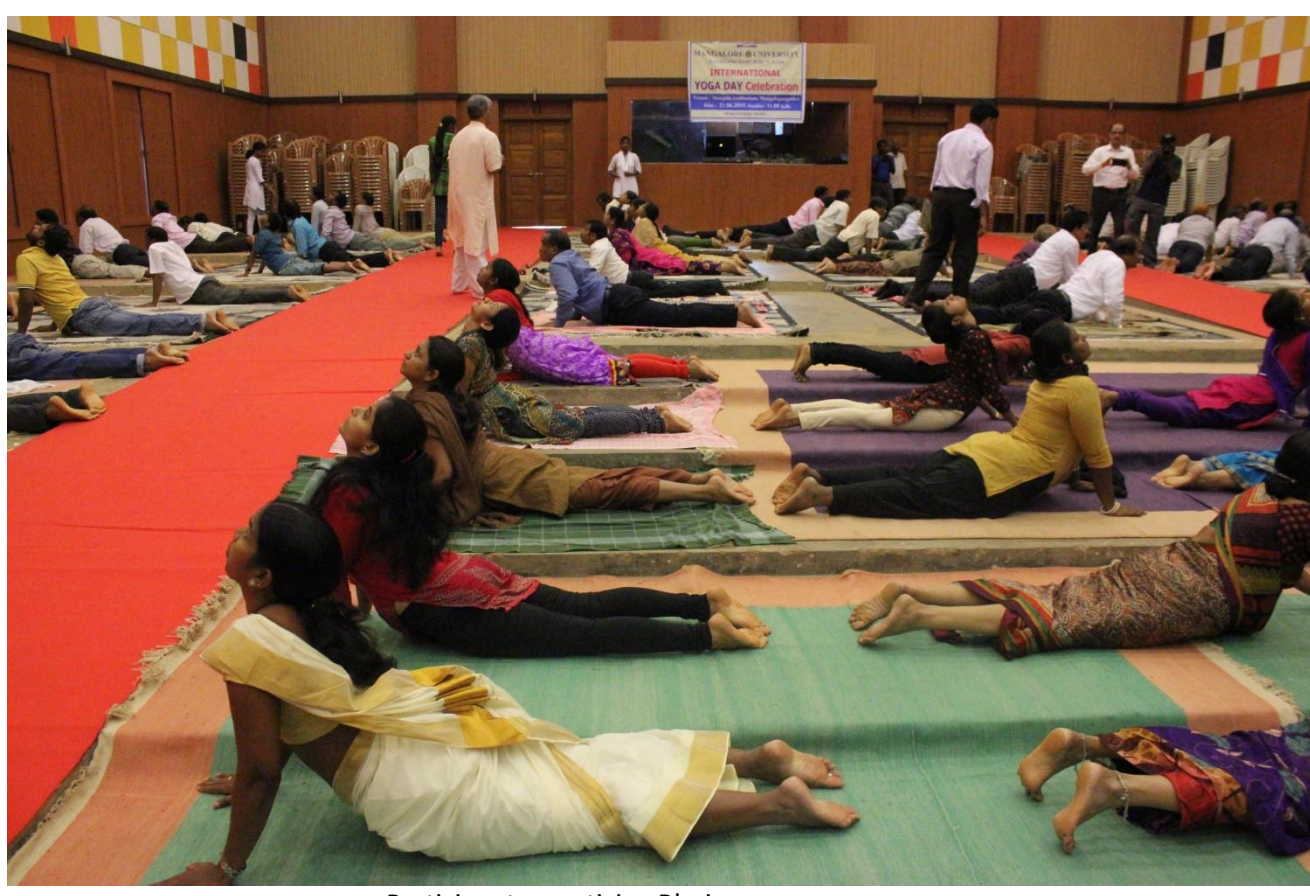
Participants practicing Bhujangasana