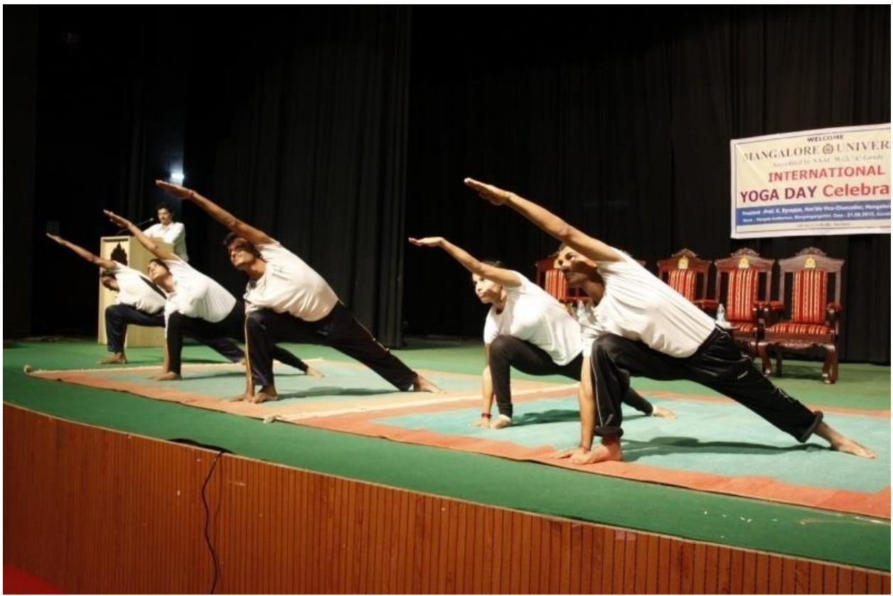
Practical demo –Parswakonasana