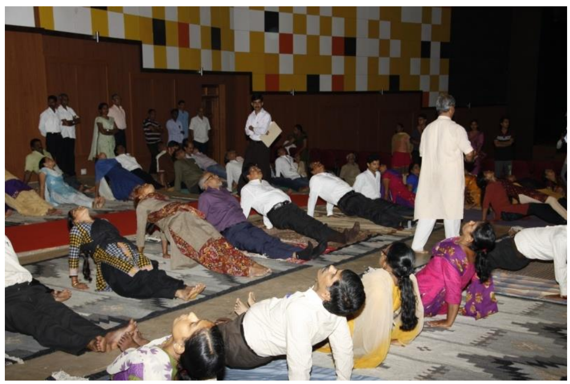
Participants practicing Purvottanasana