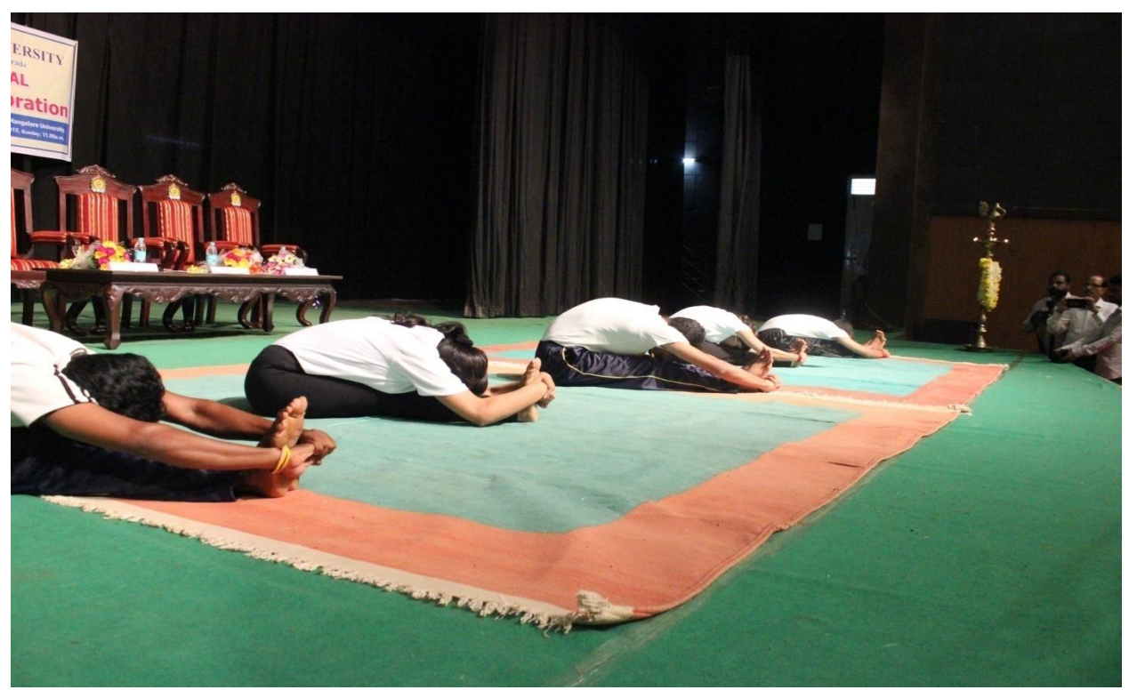
Practical demo –Pascimottanasana