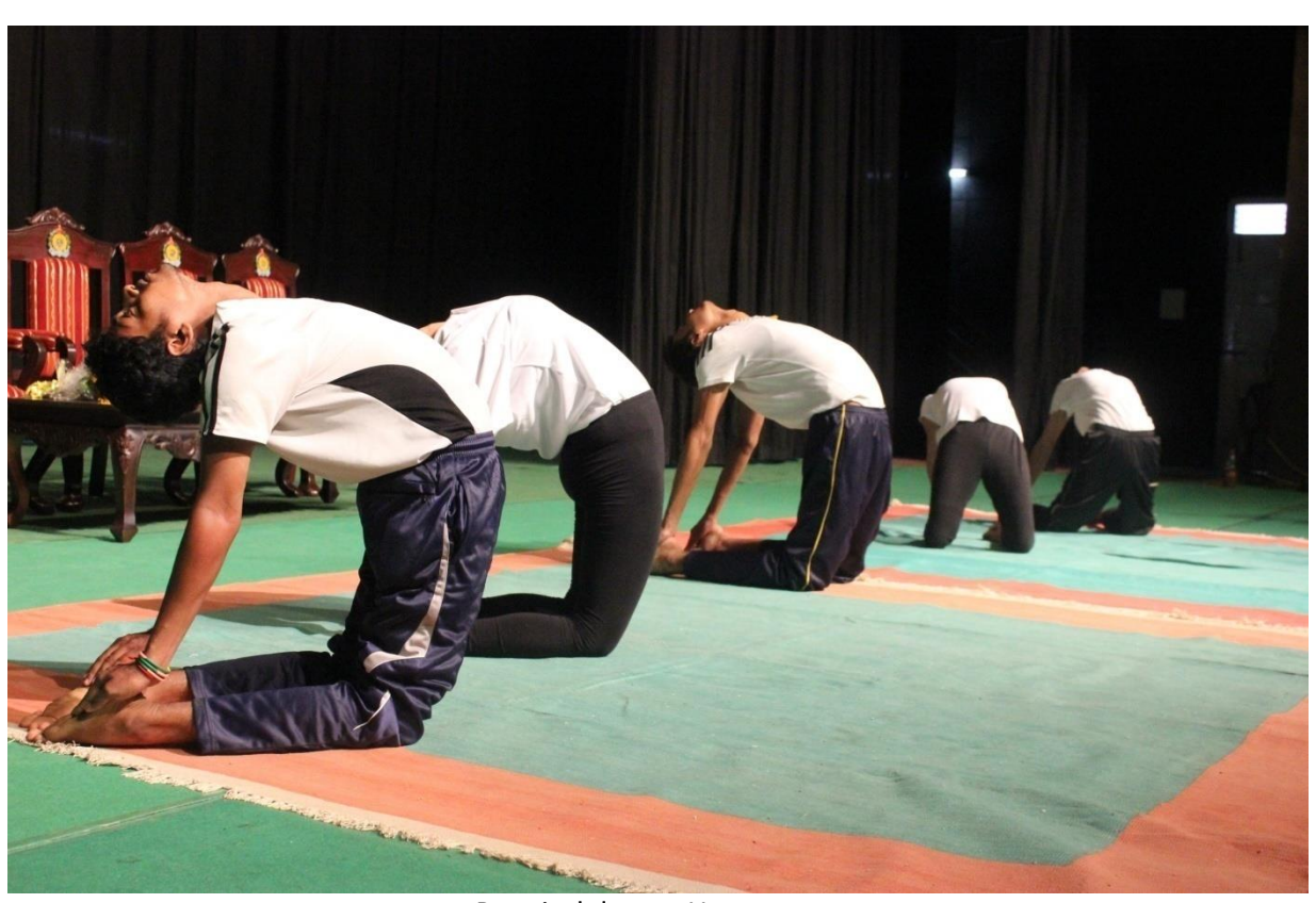
Practical demo –Ustrasana