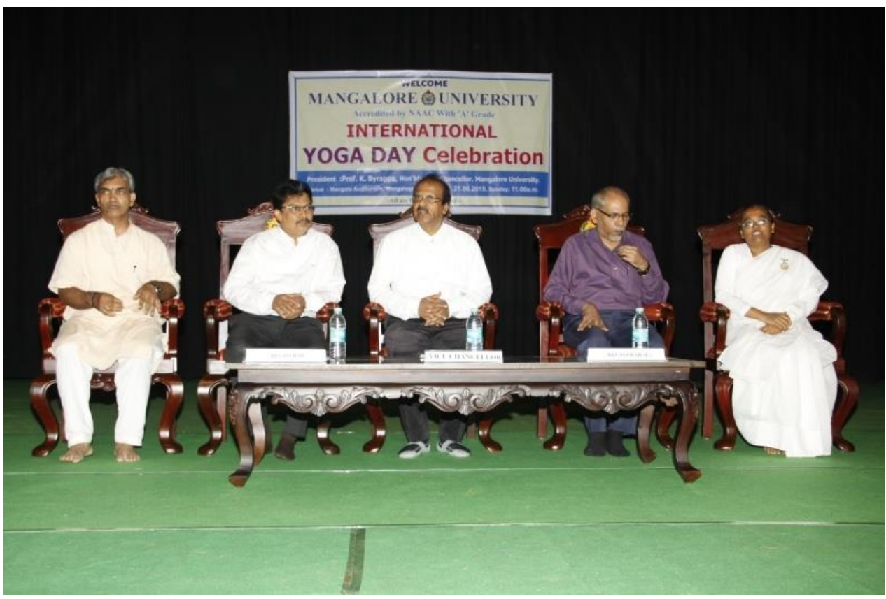
Dignitaries on the dais on the occasion of formal function – International yoga day celebration