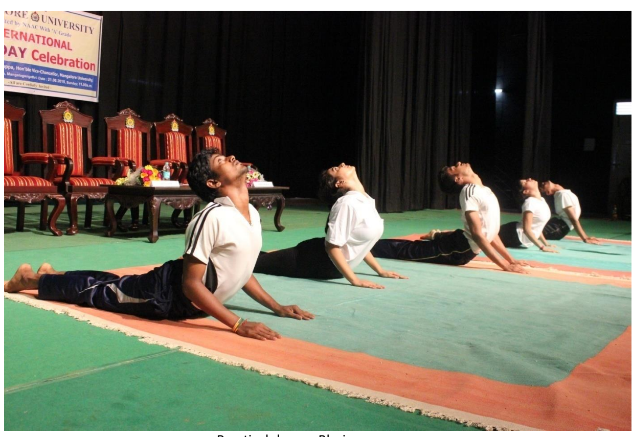
Practical demo –Bhujangasana