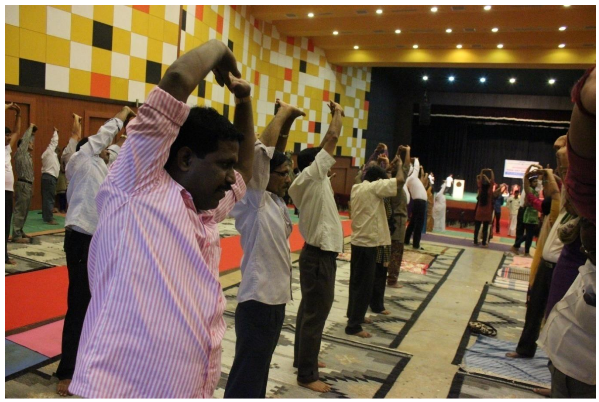
Participants practicing Tiryak Tadasana