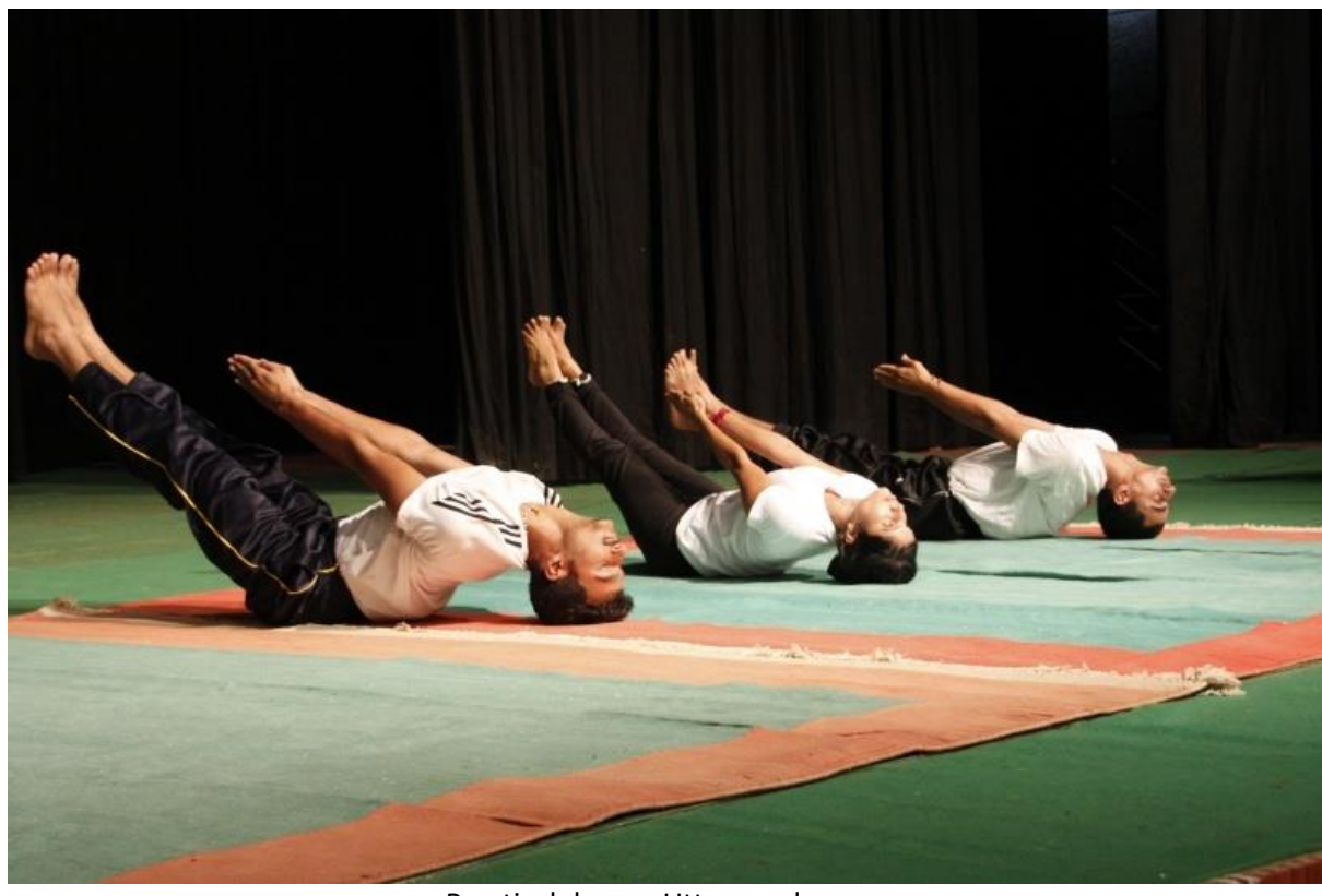
Practical demo –Uttanapadasana