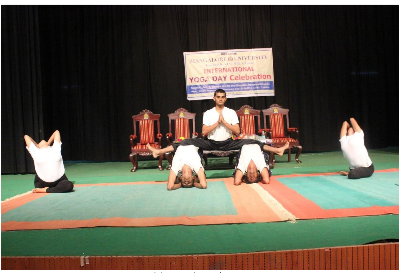
Practical demo –advanced asanas