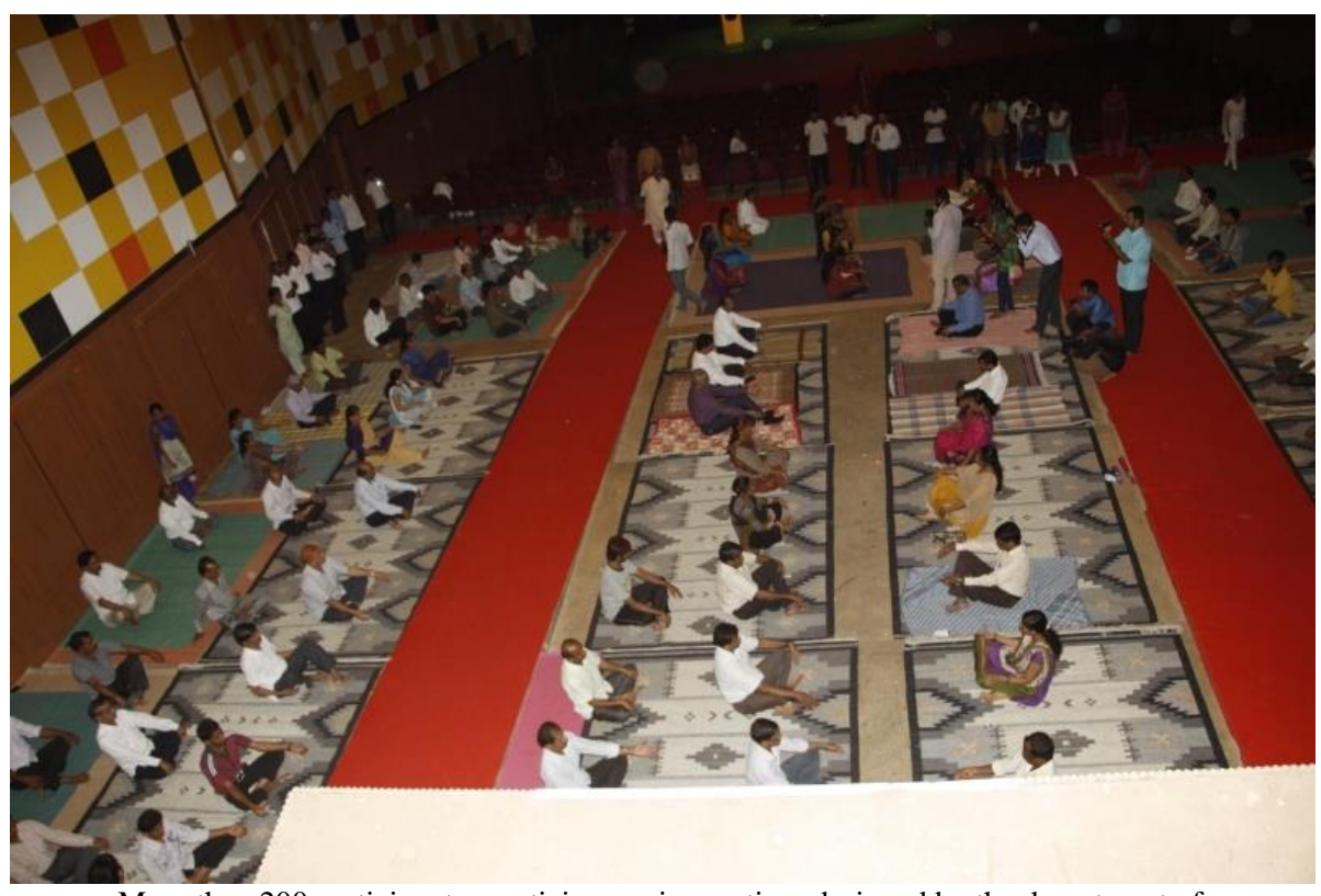
More than 200 participants practicing yogic practices designed by the department of Human Consciousness and Yogic Sciences, Mangalore University at Mangala Auditorium