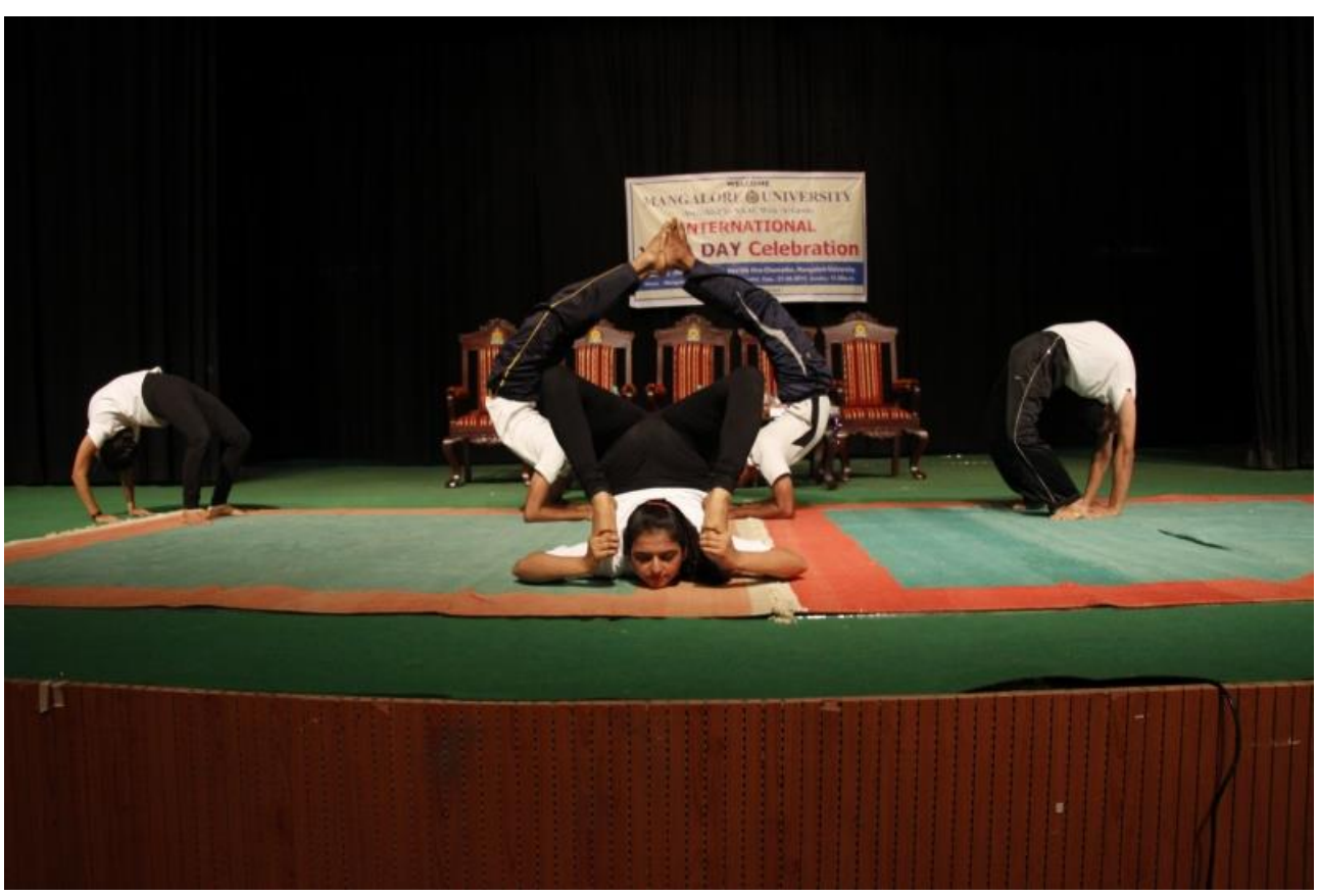
Practical demo –advanced asanas