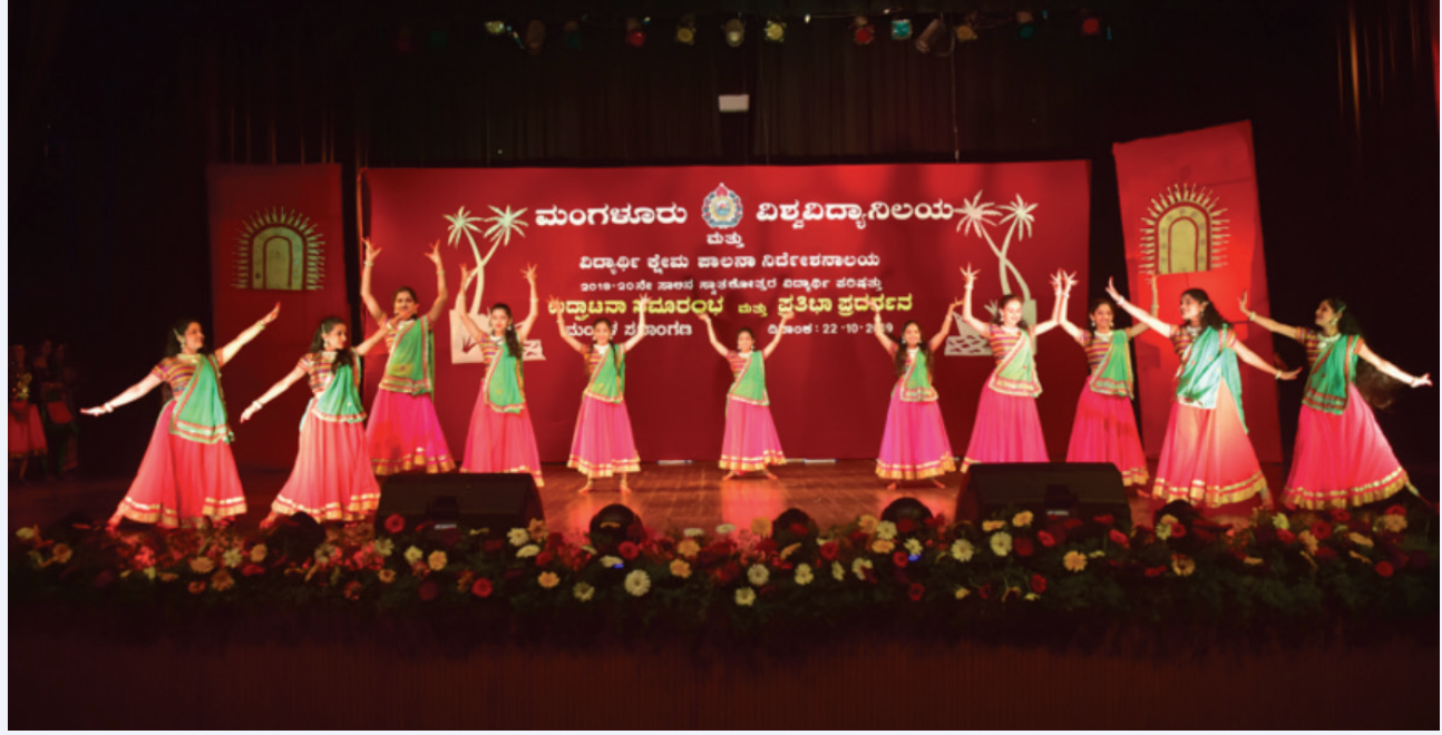
PG Students performing on Talents Day