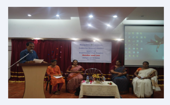
Inauguration of the workshop on Gender and Law