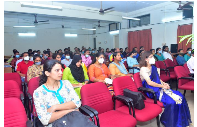
A section of PhD students attending the Workshop