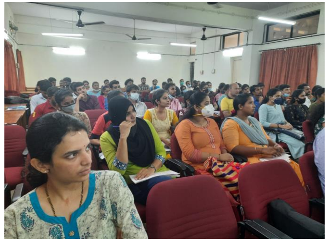
A section of the PhD students and researchers attending the Workshop