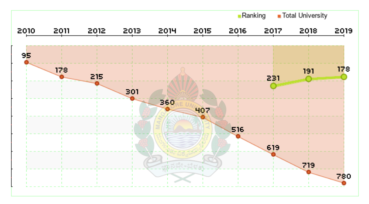
Figure 3.1 World Rankings History Diagram