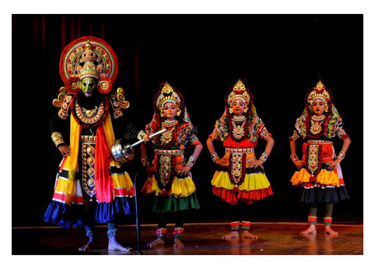
Mangalore University students performing Yakshagana