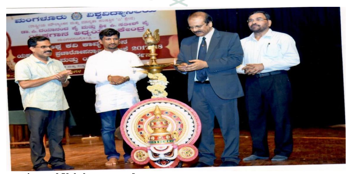
Inauguration and Yakshagana performance

Yaksha Kavi Kaavya Yaana - Yakshamangala Pracharopanyasa Malike - 2017-18