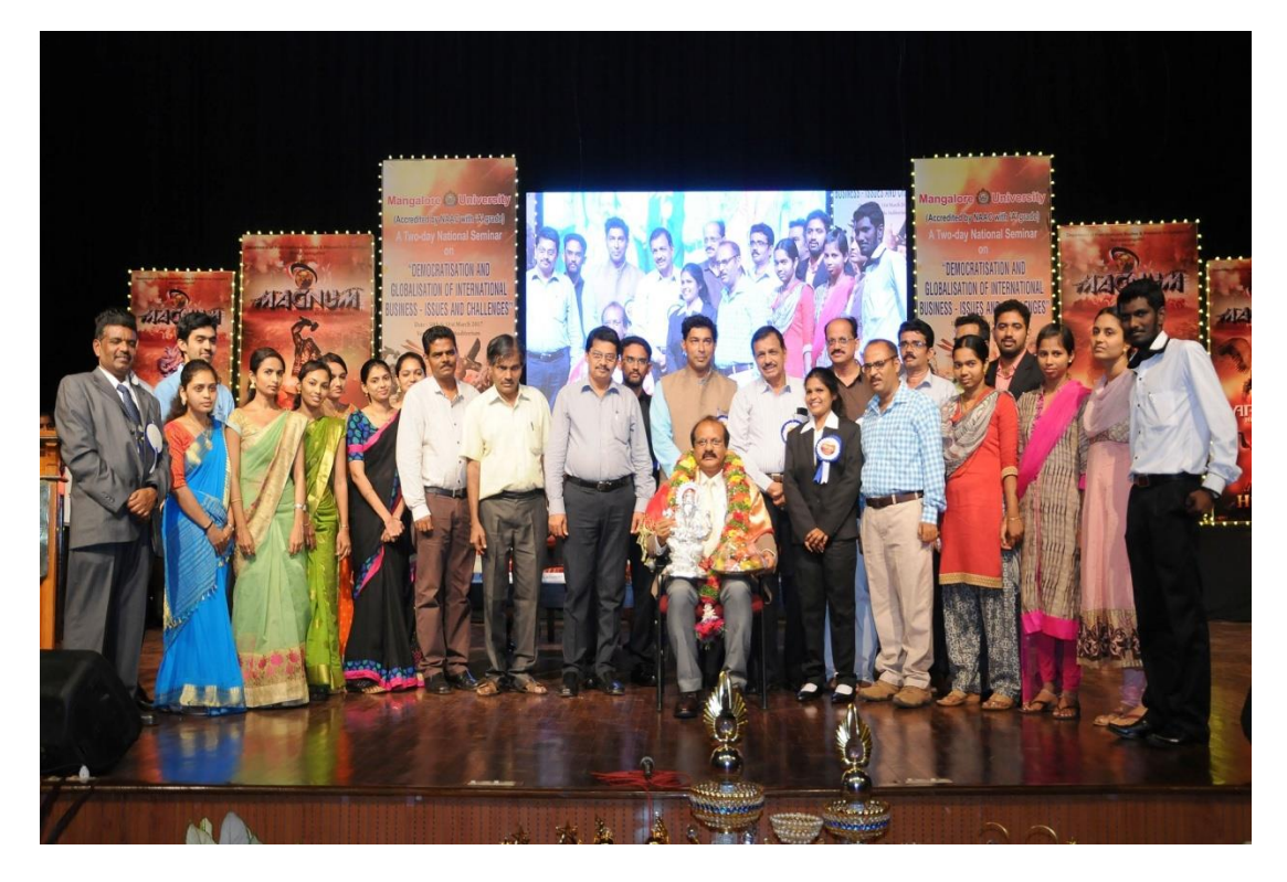
The department of Commerce organised a two day national seminar on "Democratisation and Globalisation of International Business - Issues and Challenges" from 30-31 March, 2017 at Managala Auditorium, Mangalagangothri. About 100 participants took part.