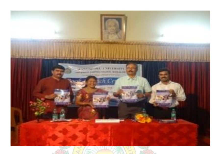
Release of an edited book on GST