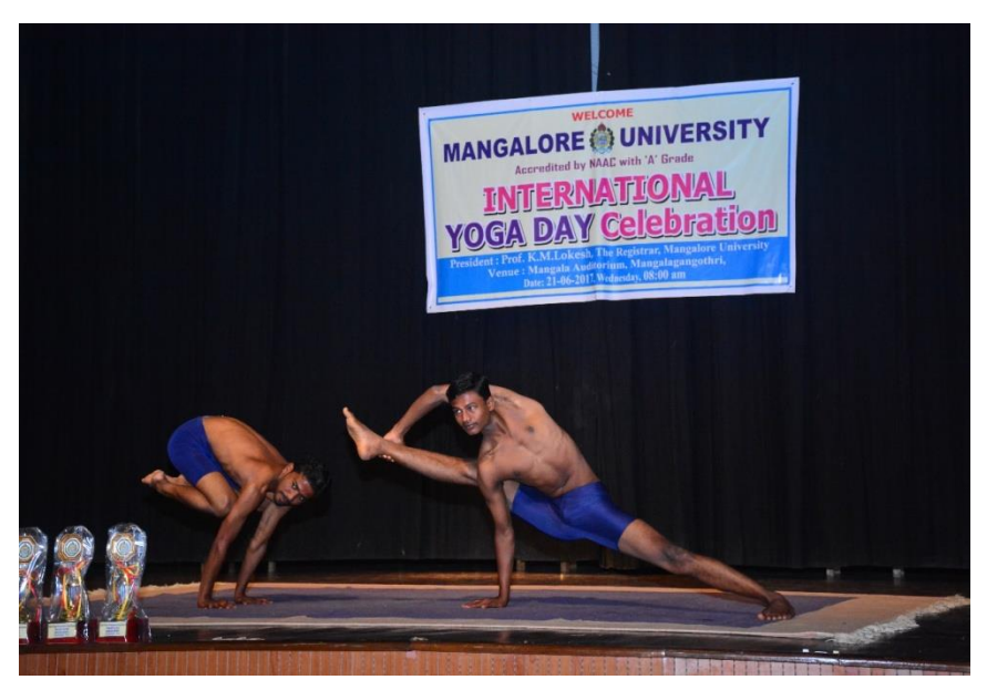
Advanced Yogasana Demo by the students of the Department of Human Consciousness and Yogic Sciences, Mangalore University.