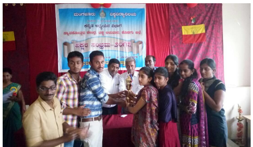
¸ÀgÀPÁj ¥ÀæxÀªÀÄ zÀeÉð PÁ¯ÉÃdÄ, PÀıÁ®£ÀUÀgÀ vÀAqÀPÉÌ ¸ÀªÀÄUÀæ «ÃgÁUÀæt ¥Àæ±À¹Û ¥ÁjvÉÆÃµÀPÀ «vÀgÀuÉ

<sup>a</sup>ÀÄAUÀ¼ÀÆgÀÄ «±Àé«zÁ央AiÀÄ <sup>a</sup>Áå¦ÛAiÀİè£À ¥ÀzÀ« PÁ⁻ÉÃf£À LaÒPÀ «zÁåyðŪÀ¼À£ÀÄß DºÁ餹, CªÀjUÉ D±ÀĨsÁµÀt ¸ÀàzsÉð, PÀ£ÀßqÀ "sÁªÀVÃvÉ ÀàzsÉð, PÀªÀ£À¸ÀàzsÉð, ZÀZÁð gÀ¸À¥Àæ±Éß, , ÀàzsÉðAiÀÄ£ÀÄß °À«ÄäPÉÆ¼Àî ÁVvÀÄÛ. ÀÄ. «zÁåyðUÀ¼ÀÄ PÁ-ÉÃdÄUÀ½AzÀ 80 ««zsÀ DUÀ«Ä¹zÀÝgÀÄ. ¢£À«r £ÀqÉzÀ ««zsÀ ¸ÀàzsÉðUÀ¼À°è «eÉÃvÀgÁzÀªÀjUÉ ¥Àæ±À¹Û PÉÆgÀ-Á¬ÄvÀÄ. ¥ÁjvÉÆÃµÀPÀªÀ£ÀÄß , ˻ÀÄUÀæ «ÃgÁUÀætÂ ¥Àæ±À¹ÛAiÀÄÄ ÄgÀPÁj ¥ÀæxÀªÀÄ zÀeÉð PÁ⁻ÉÃdÄ, PÀıÁ®£ÀUÀgÀ CªÀjUÉ zÉÆgÀQvÀÄ.