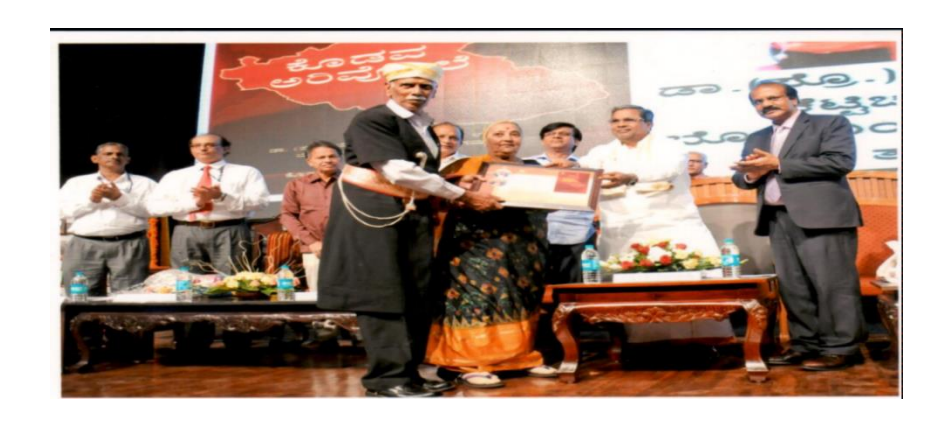
Honourable Chief Minister Sri Siddaramaiah honouring the writers with Mementoes

Activities of Prasaranga from January 2017 to June 2017.