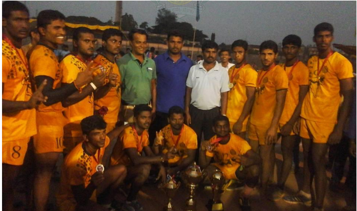
Winners of Mangalore University Kabaddi Team in South Zone Inter University Kabaddi competitions