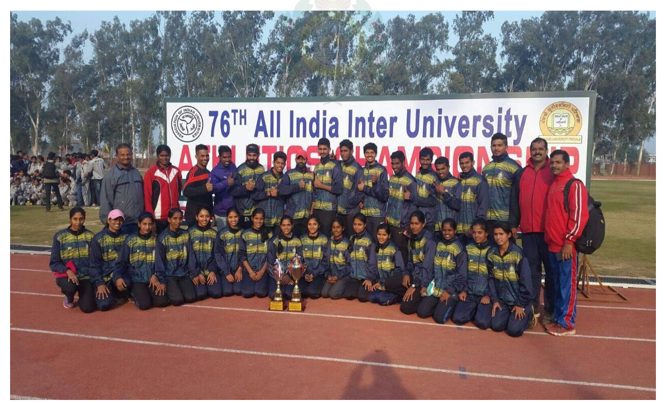
Mangalore University Athletic Men Team secured second place and Women Team secured third place. In overall championship Mangalore University secured Second place in All India Inter University Athletics championship held at Punjab University, Patiala from December 28<sup>th</sup> 2015 to 3<sup>rd</sup> January 2016.

• Mangalore University organized All India Inter University Cross Country (Men & Women) Championship on October 11, 2015 at Alvas College, Moodbidri. Mangalore University Men Team secured Gold Medal and Women Team secured Silver Medal and in Overall championship Mangalore University secured First Place in All India Inter University Competitions for the first time in the history of Mangalore University.