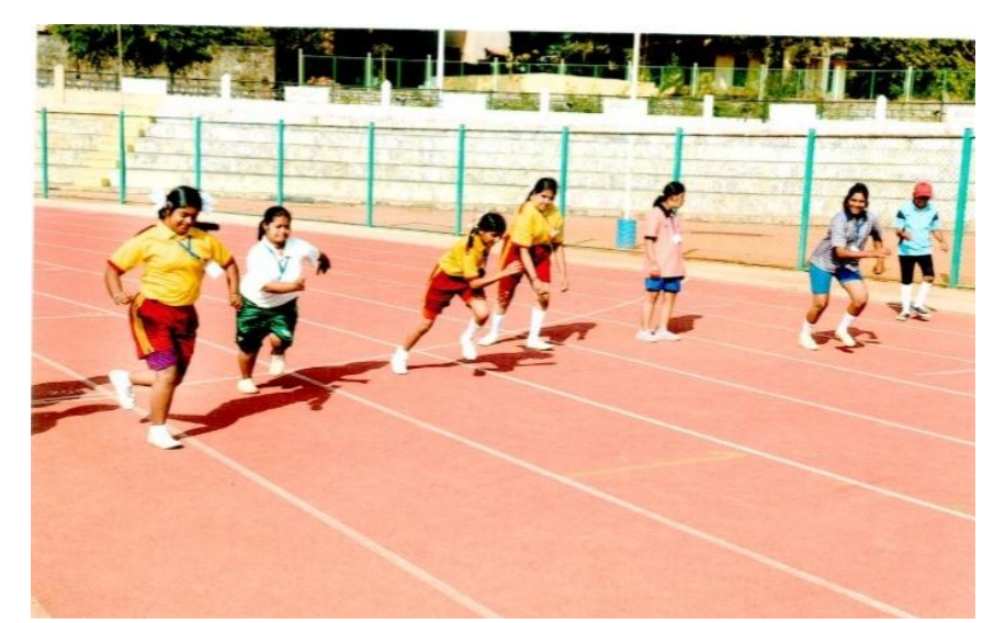
Physical Disabled students participating in the Intercollegiate Athletics Championship and Sports

• Mangalore University organized All India Inter University Cross Country (Men & Women) Championship on October 11, 2015 at Alvas College, Moodbidri. Mangalore University Men Team secured Gold Medal and Women Team secured Silver Medal and in Overall championship Mangalore University secured First Place in All India Inter University Competitions for the first time in the history of Mangalore University.