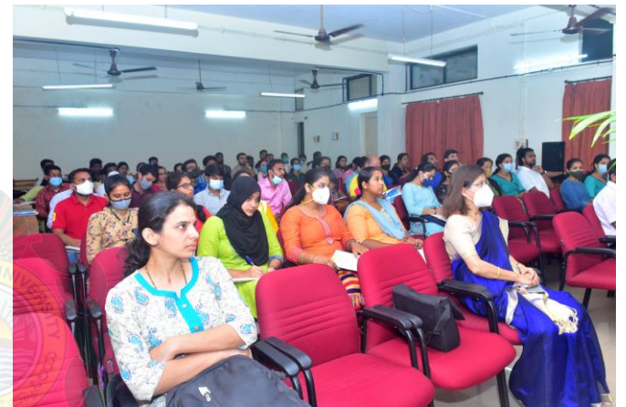
A section of PhD students attending the Workshop