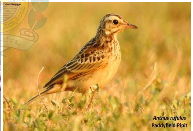
Anthus rufulus Paddyfield Pipit