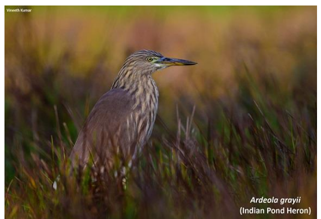
Ardeola grayii (Indian Pond Heron)