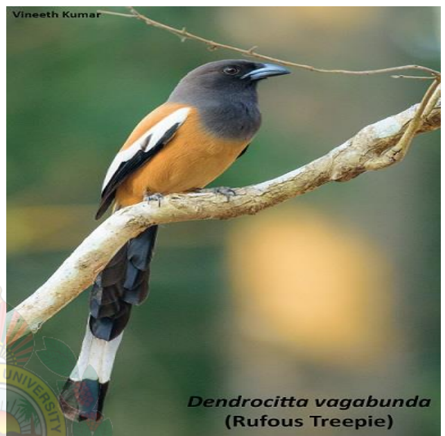
Dendrocitta vagabunda (Rufous Treepie)