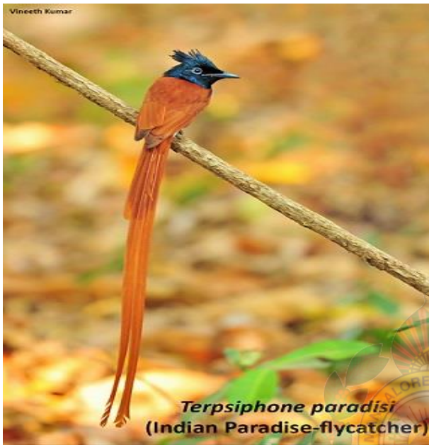
Terpsiphone paradisi (Indian Paradise-flycatcher)