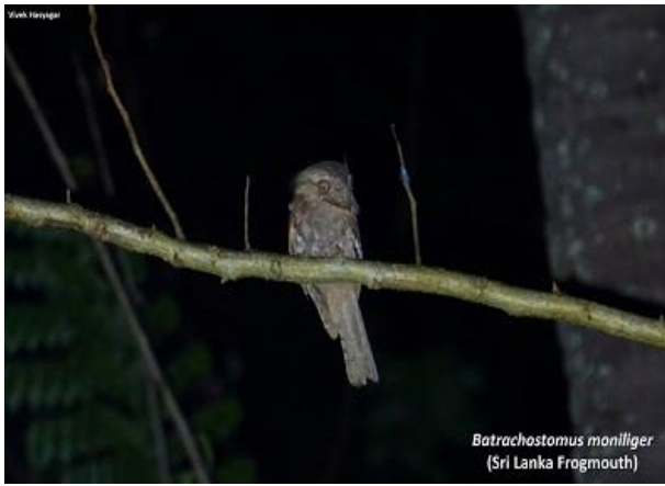
Batrachostomus moniliger (Sri Lanka Frogmouth)