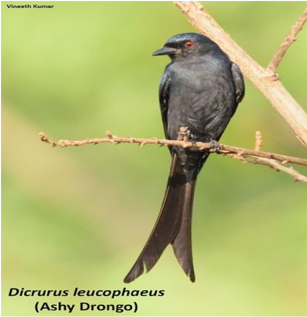
Dicrurus leucophaeus (Ashy Drongo)