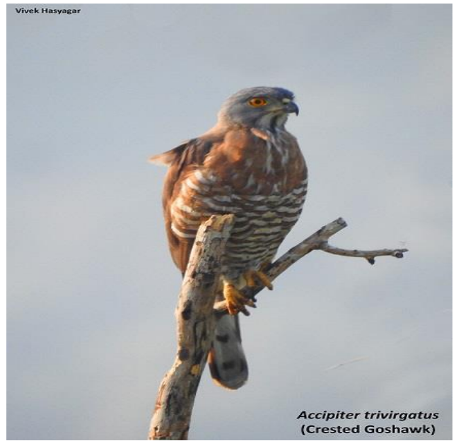
Accipiter trivirgatus (Crested Goshawk)