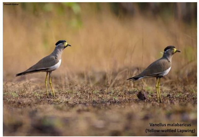
Vanellus malabaricus (Yellow-wattled Lapwing)