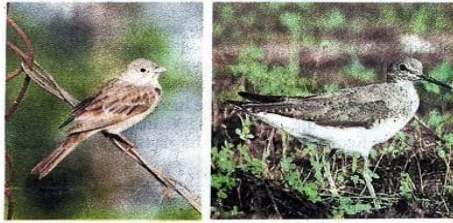
(Left) The Grey-Necked Bunting and the Green Sandpiper spotted at Mangalore University during the bird count from February 12 to February 15.