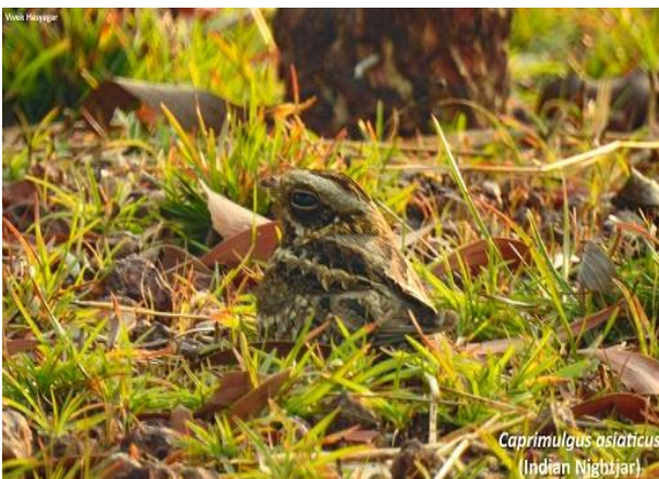
Caprimulgus asiaticus (Indian Nighthawk)