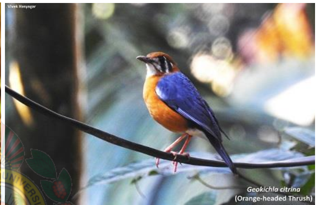
Geokichla citrina (Orange-headed Thrush)