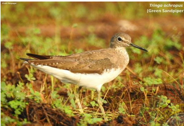
Tringa ochropus (Green Sandpiper)