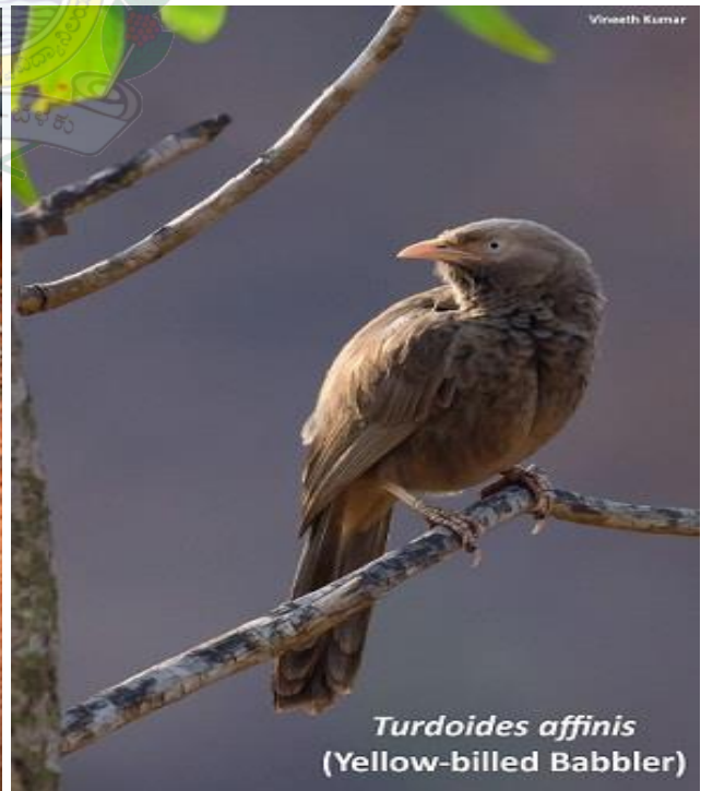
Turdoides affinis (Yellow-billed Babbler)