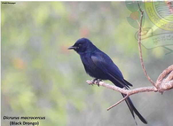
Dicrurus macrocercus (Black Drongo)