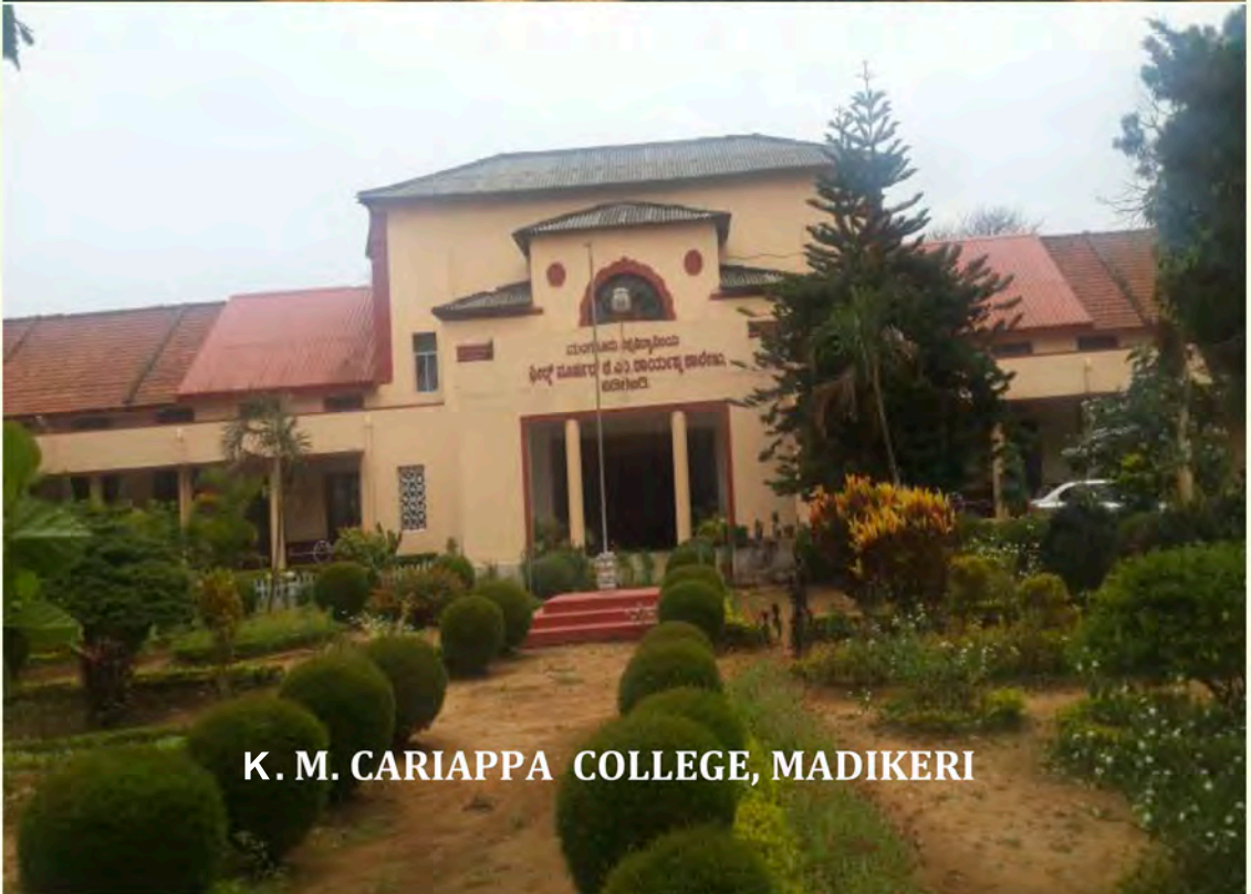
K. M. CARIAPPA COLLEGE, MADIKERI