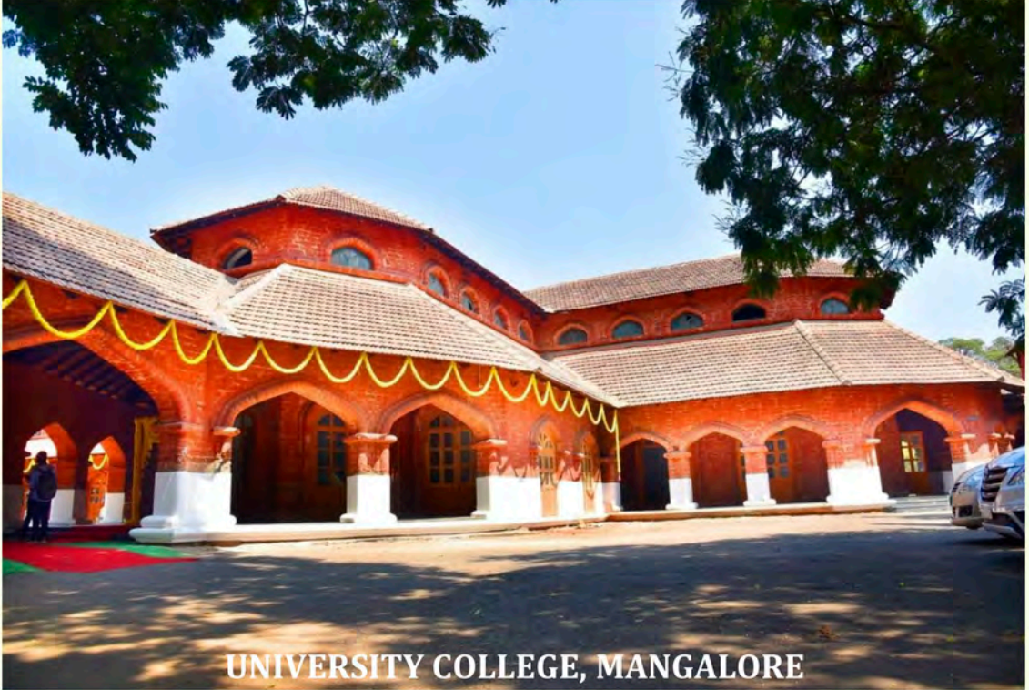
UNIVERSITY COLLEGE, MANGALORE