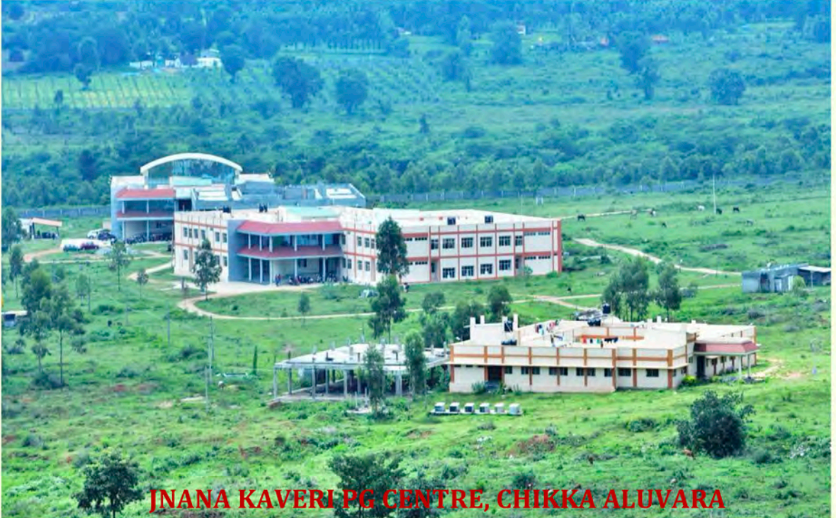
JNANA KAVERI PG CENTRE, CHIKKA ALUVARA